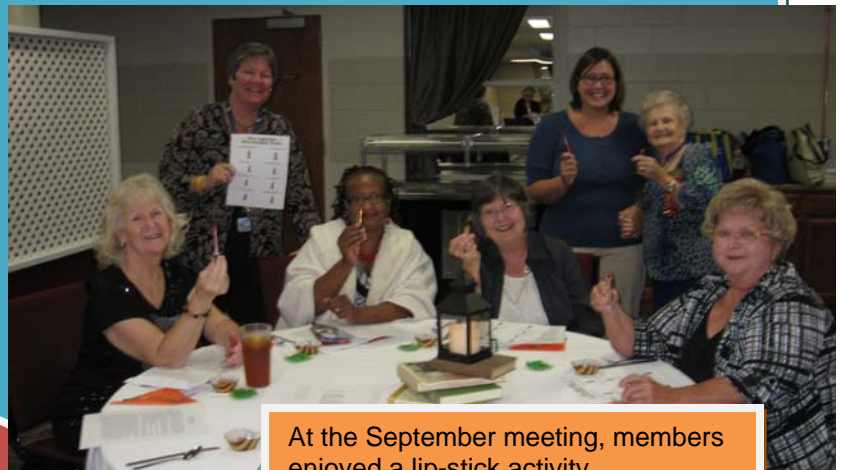
At the September meeting, members enjoyed a lip-stick activity