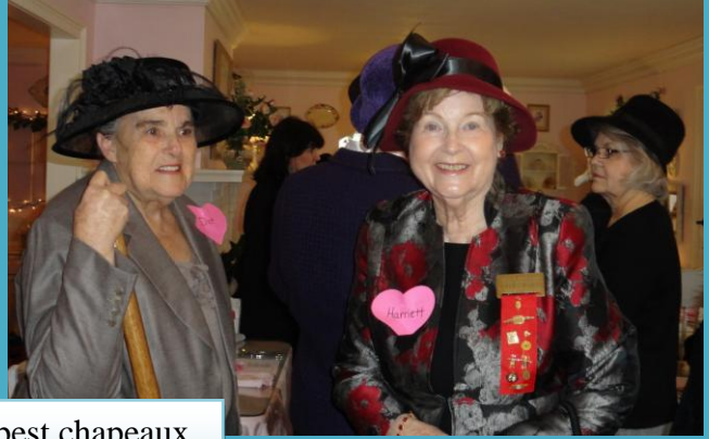
Alpha Xi members sport their best chapeaux at February's Mad Hatter's Tea Party